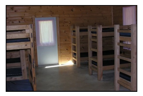
Creekside and Woodland Cabins sleep 12 per cabin. Each cabin has integral showers and restrooms. Creekside cabins are winterized.