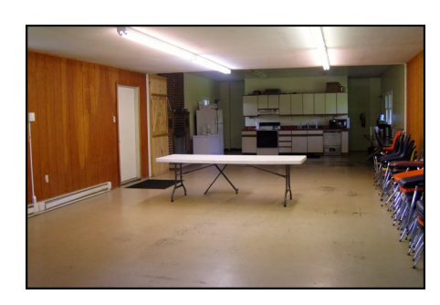
Graham Village- Sleeps 72. 3 sets of cabins, a lodge with shower facilities and a beautiful open setting highlight this economical retreat option.