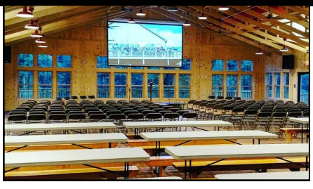
The Refuge-Our new dining hall and multi-purpose building can accommodate up to 280 diners. It has space for programming and worship with a fabulous sound and multi-media system