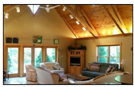
The Elijah House-Sleeps 36 with a commercial kitchen, laundry facilities, lobby area and two large restrooms with showers